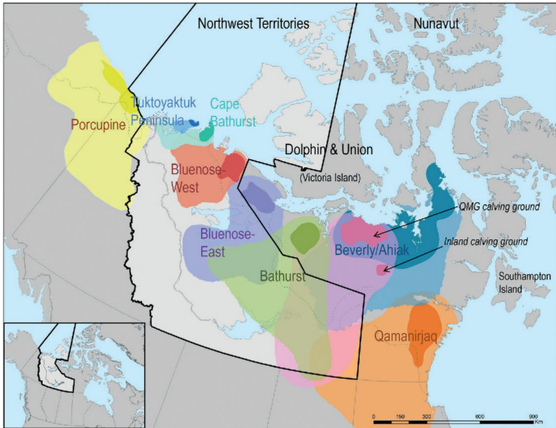
Figure 1. Historical Northwest territories barren-ground herd ranges and calving areas (1996-2018; https://www.enr.gov.nt.ca/en/services/barren-ground-caribou ).

A fundamental element whose importance cannot be overlooked in the study of the biology and ethology of the caribou is that this animal is constantly in motion and requires vast spaces to survive. This aspect is clearly connected to the origins of the nomadism of the Indigenous peoples of the Northwest Territories. The need to find food is the primary factor that pushes the caribou to migrate, often covering distances of 200 to 300 kilometres. The possibility of surviving the long harsh winter depends on their ability to find nourishment even under the snow. The snow cover is raised and removed with blows from