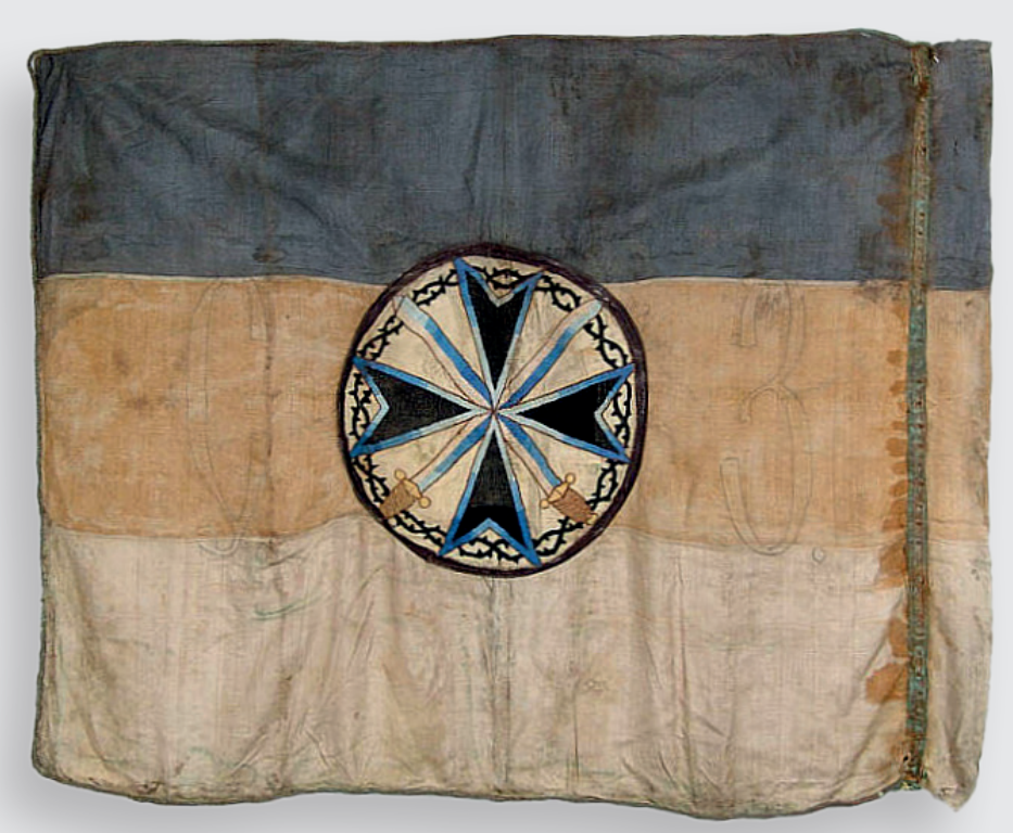
Società Italiana di Storia Militare