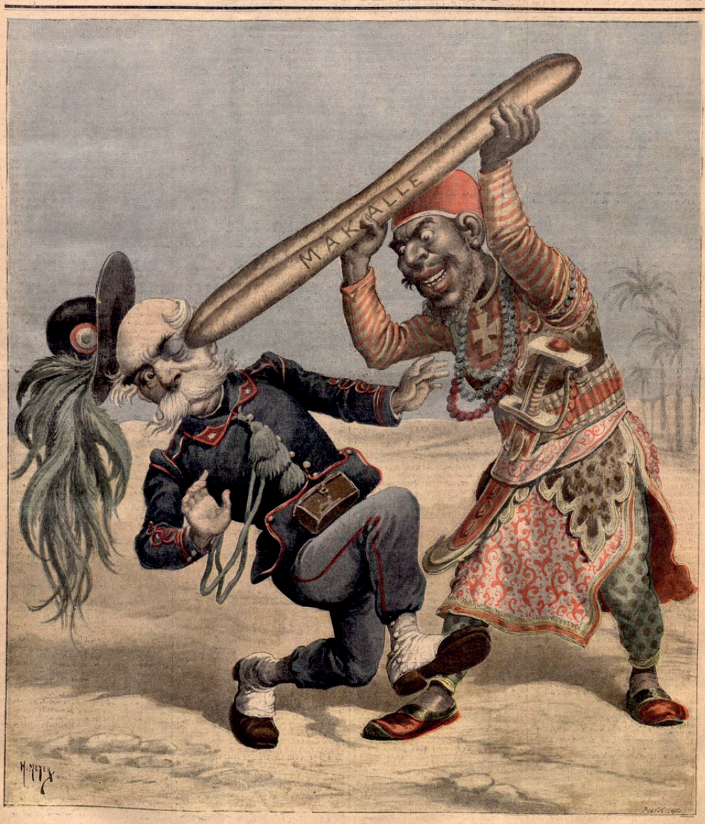
LE PAIN COMPLET