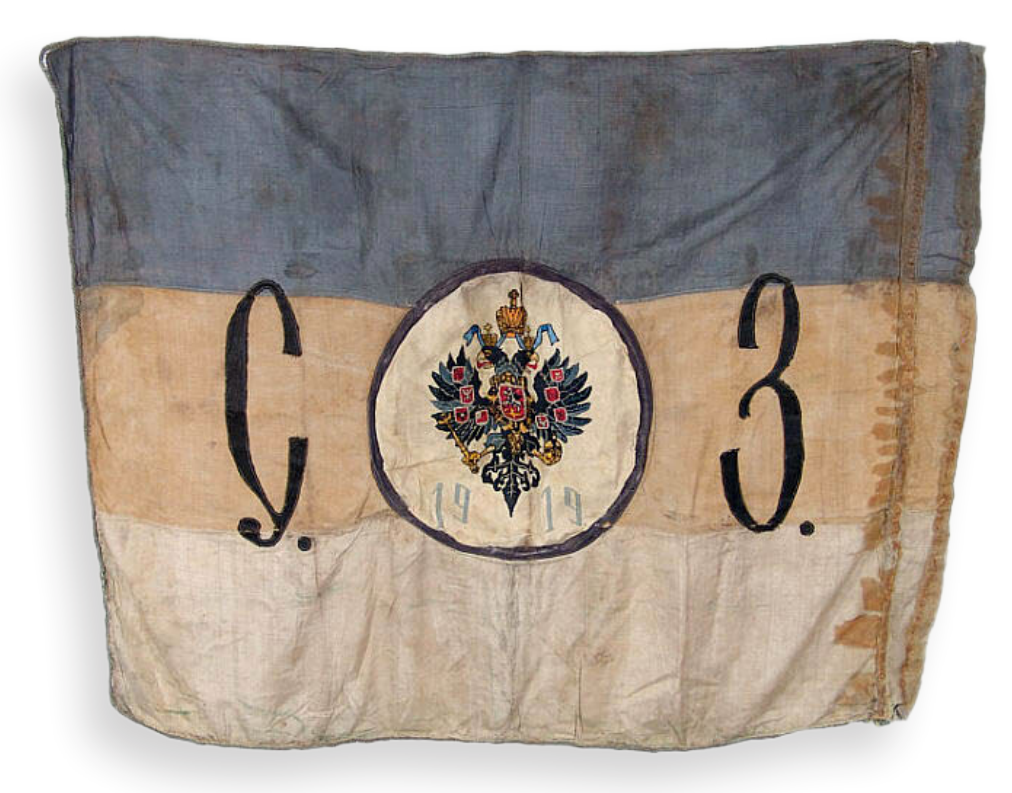
Società Italiana di Storia Militare