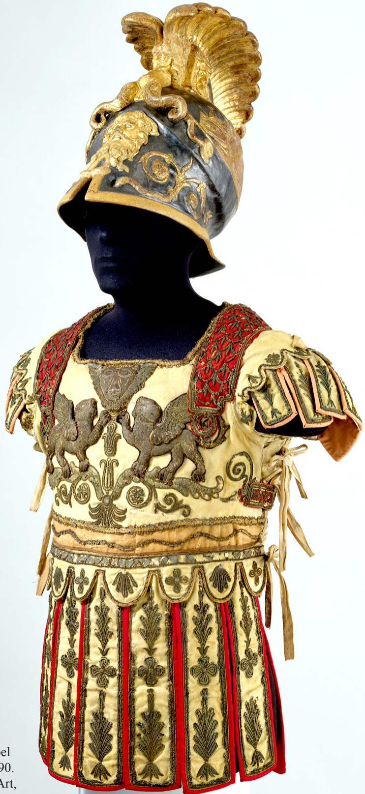
Costume Armor in the Classical Style Helmet includes original paper label of Hallé French ca. 1788–90.