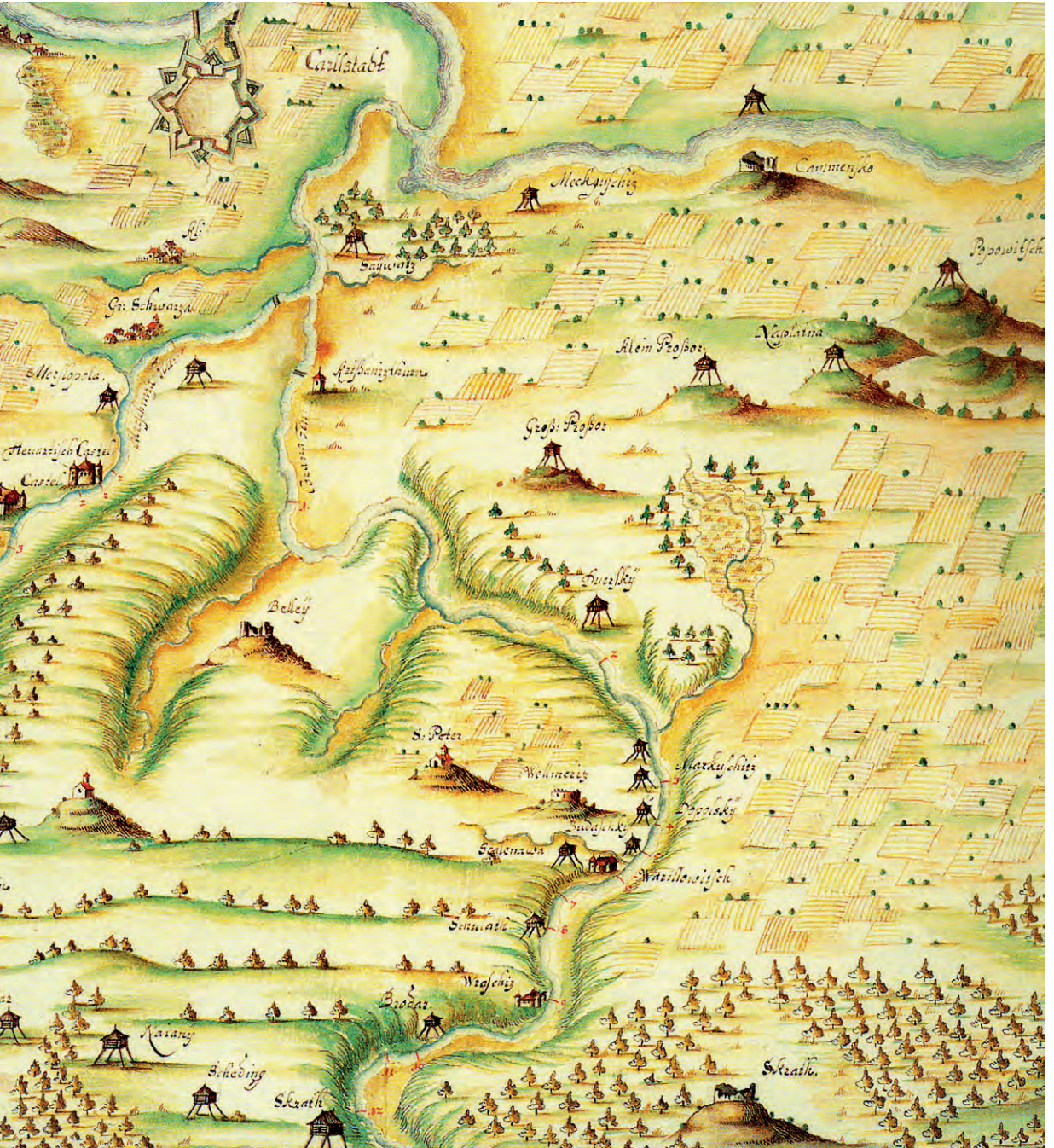
Fig. 3 A detail of Martin Stier's large-scale map of the central part of the Karlovac Generalate compiled in 1657. The scope of the map is the fortified town of Karlovac (built in 1579) and the defense strategy of its immediate surroundings (note the watchtowers and river crossings!). Karlovac was one of the most important strongholds of the Croatian border. (Austrian National Library, Cod. 8608, fol. 74)