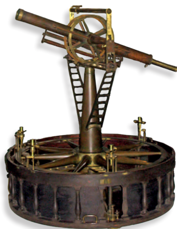
3-foot Ramsden theodolite from 1791 used during the principal Triangulation of Great Britain. Now in the Science Museum, London. Photo by User:geni, December 2008. CC-BY-SA GDFL