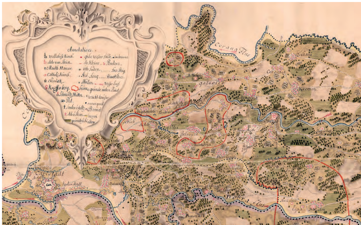
Fig. 8 A section of a topographic map of the former Karlovac Captaincy drafted in 1748 by Johann Andreas Schillinger at a scale of 1:43,200 (explanation key enlarged by author). Compiled almost thirty years before the first military survey, it represents one of the pioneering works of the Genie Corps accompanied by local staff. (War Archives, Vienna, B.IX.a.859-02)

ducted the survey and produced maps of each captaincy at a scale of 1:43,200 (Fig. 8). 51 Upon the survey of the captaincies, he summarized his results into a topographic map of the whole Karlovac Generalate at a scale of 1:100,000 (Fig. 9). 52