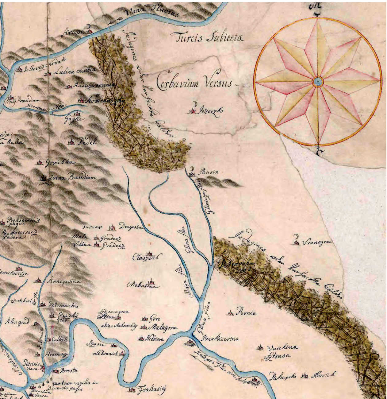
Fig. 5 A detail of the military map of Croatian borderland along the river Una that was drafted in 1688, immediately after the suppression of the Ottomans. The defense of the border with Bosnia (Turkey) relied on natural barriers, and thus a dense forest belt is marked along the border line ( Waldverhacke ). (National Library, Budapest, TK 530)