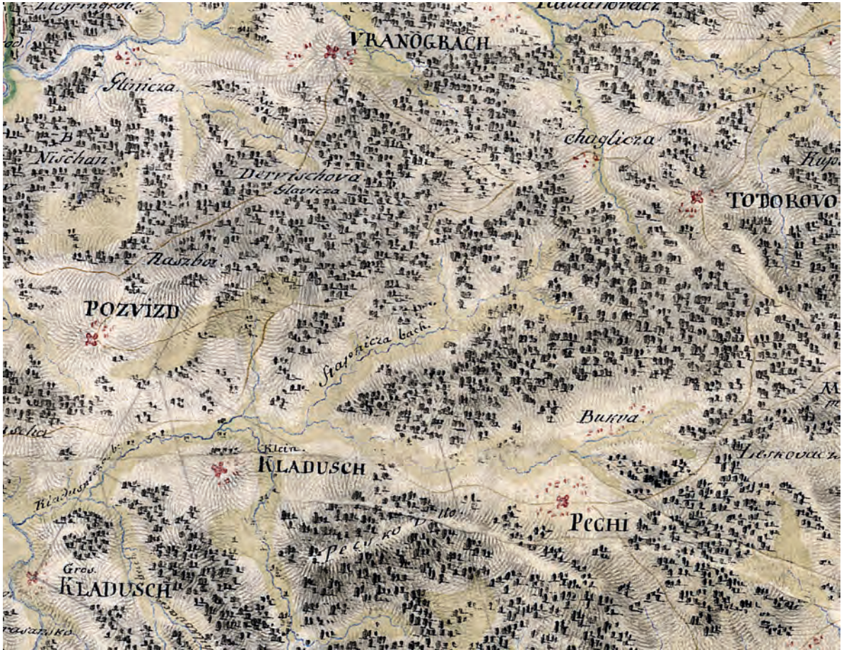
Fig. 11 SW Bosnia on a topographic map compiled based on a secret mapping campaign in 1784. This is a copy from 1794 with new borders established after the Treaty of Sistova. Note the trigonometric network in the back that was drawn in pencil. (War Archive, Vienna, B.IX.c.932)

to the same cartographic key and drawn in the same style as the maps of the first military survey, yet with less accuracy. In 1794, another copy of the same map was compiled that showed the newly established border upon the Peace Treaty of Sistova (1791) that ended the war (Fig. 11). 74