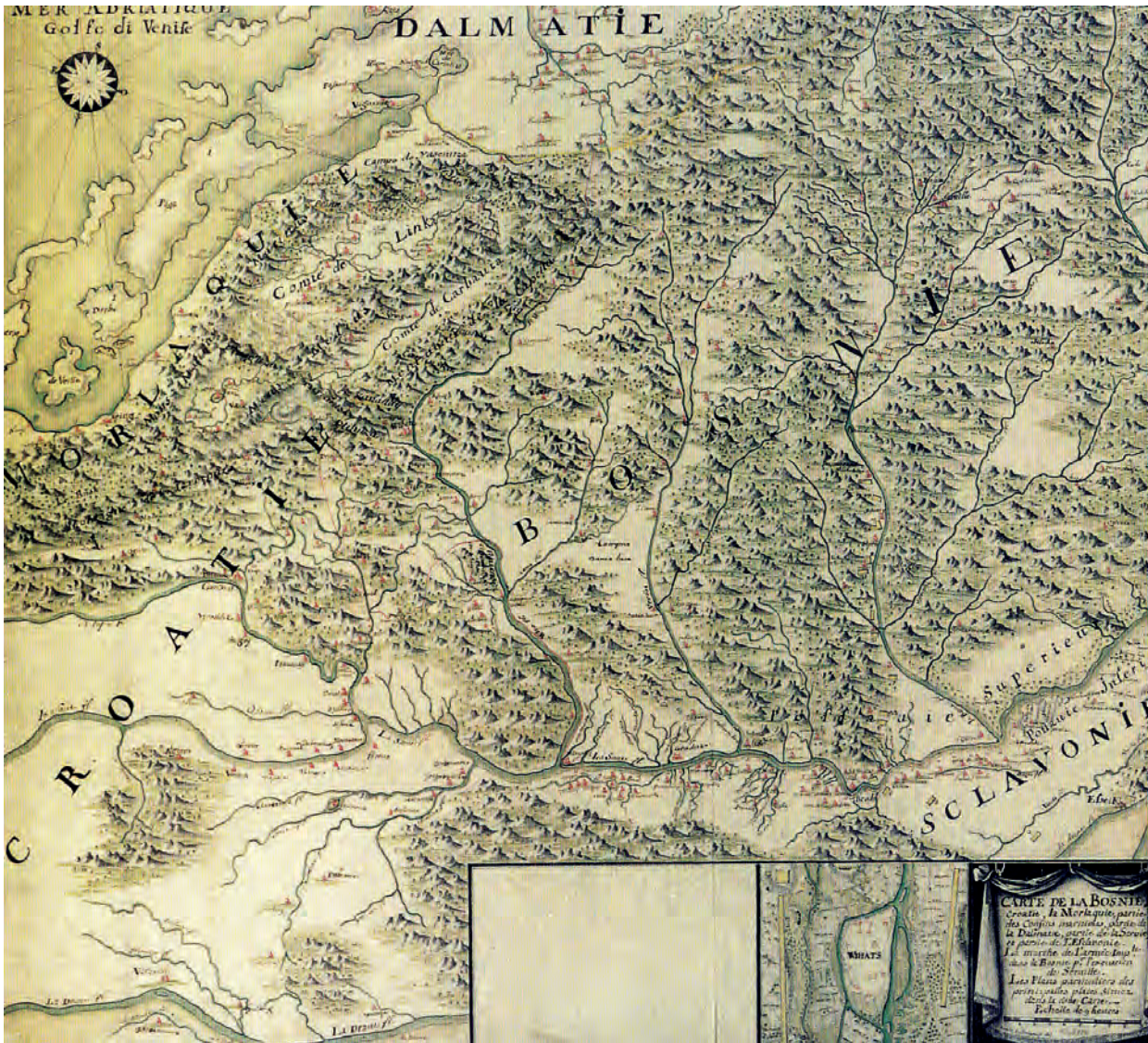
Fig. 6 The first Habsburg military map of Bosnia based on the reconnaissance made during Eugen of Savoy's offensive in 1697. The map is reversed in the way that it can be read accurately only by reading it in a mirror. (War Archive, Vienna, B-IX-a-934)

cartographic material created in 1697. Sparr de Benstorf is best known as the author of a series of siege plans from 1739. Erich HILLBRAND and Friederike HILLBRAND, « Ein Lothringer zeichnet die niederösterreichische Donauregion Ein Beitrag zum Leben und Werk François Nicolas Sparrs », Jahrbuch für Landeskunde von Niederösterreich , 59 (1993), p. 94.