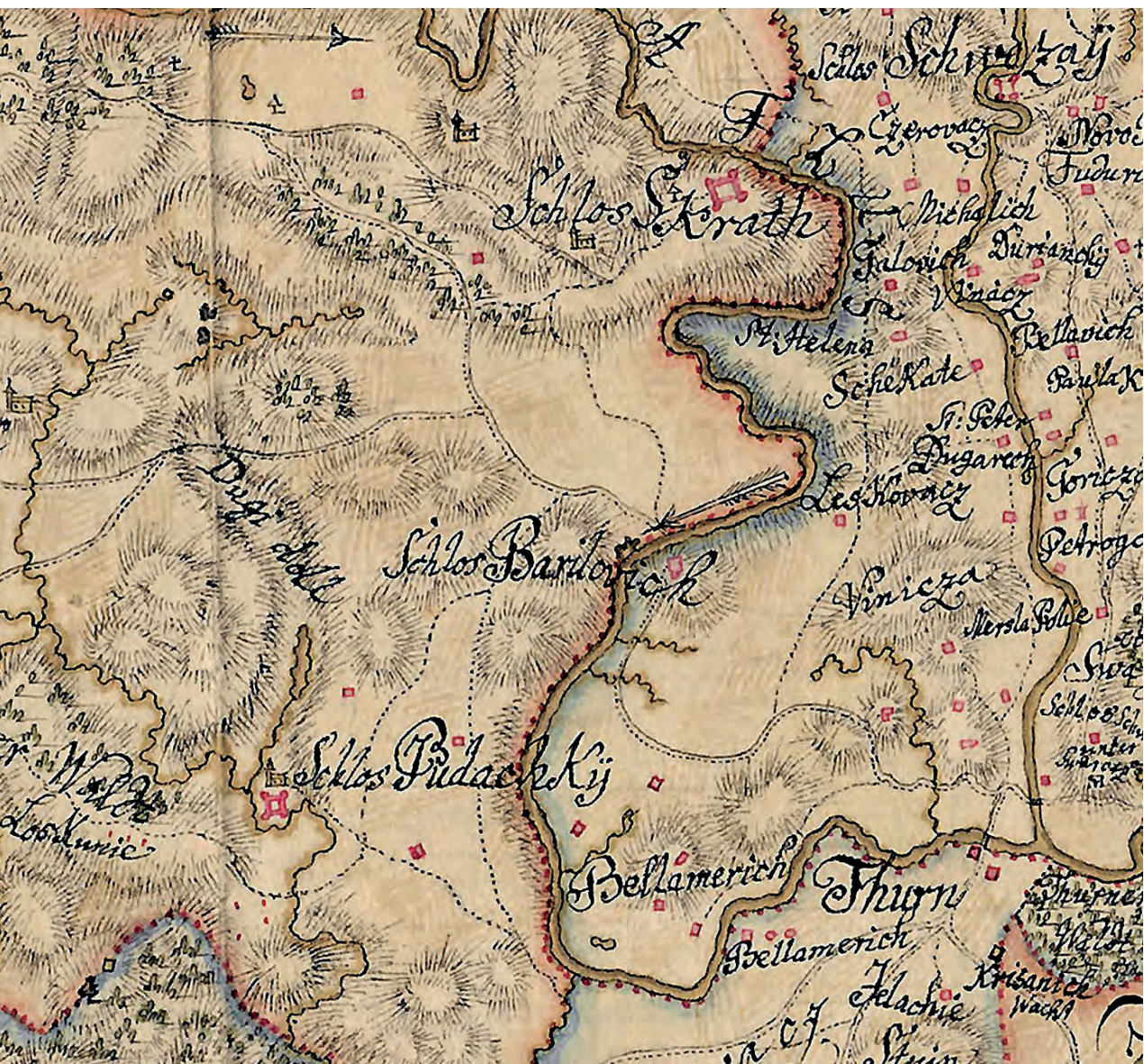
Fig. 9 A section of Andreas Schillinger's military map of the Karlovac Generalate compiled in 1748 at a scale of 1:100,000. Physical geography is presented in the same style as would be applied on Josephinian topographic maps (War Archives, Vienna, BIX.a.783-02)