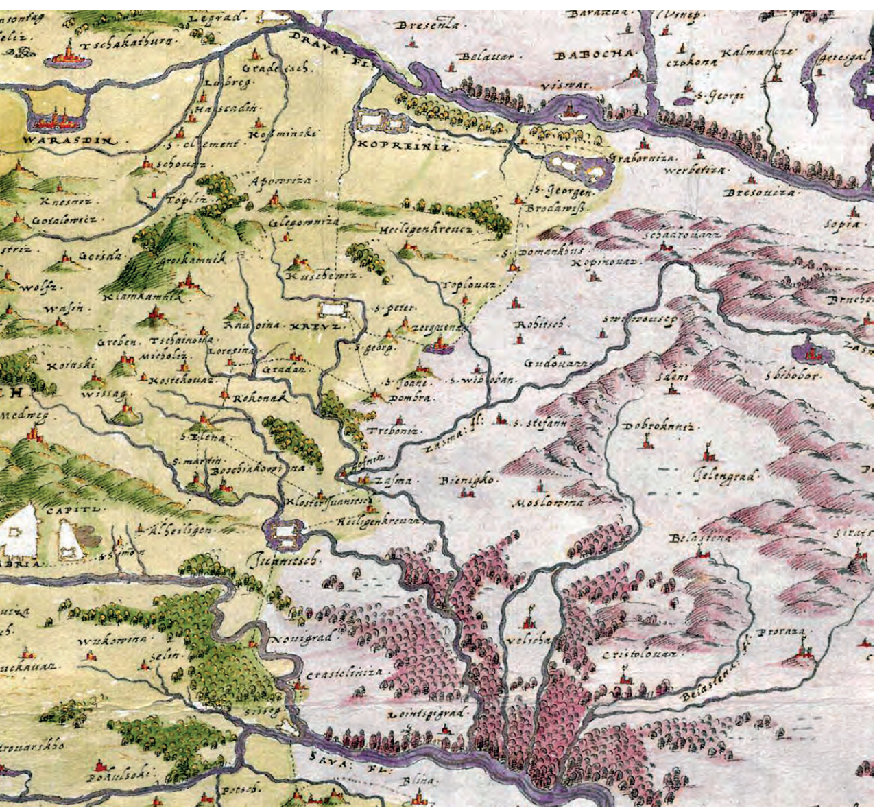
Fig. 1 A detail of a map of Croatia and Slavonia compiled by the Angielini brothers about 1566. It shows a part of the Croatian Military Border (green) and a part of Slavonia under Ottoman control (reddish). An innovative method of displaying relief and vegetation was applied. Note the alert system marked along the border (a thin dashed line at the edge of Habsburg territory that connects the border posts). (Austrian National Library, Cod. 8609, fol. 2)