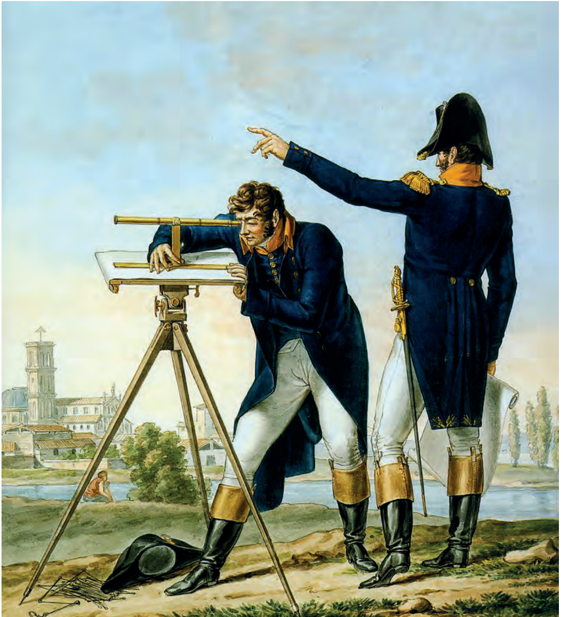
French Engineer geographers Gouache, 1812, by Carle Vernet (1758–1836) and others after design by Bardin. From a series: Règlement sur l'habillement (..) des troupes de terre de l'armée française , vol. 4. Paris, Musée de l'Armée. (Commons de. wikipedia)