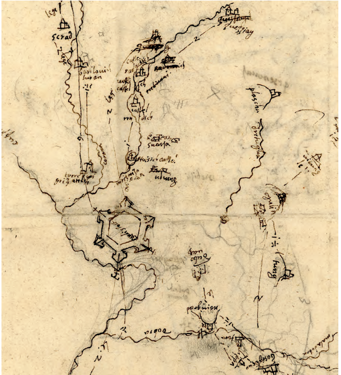
Figure 2 A newly erected fort of Karlovac, a site of the Croatian borderland and its vicinity on a sketch by Ivan Klobučarić (ca. 1605). The lines between the fortifications and the radial lines from the hills testify to the use of a compass in the reconnaissance of the terrain. (Steiermärkisches Landesarchiv, Graz Sammlung Clobucciarich, Blatt 82a).