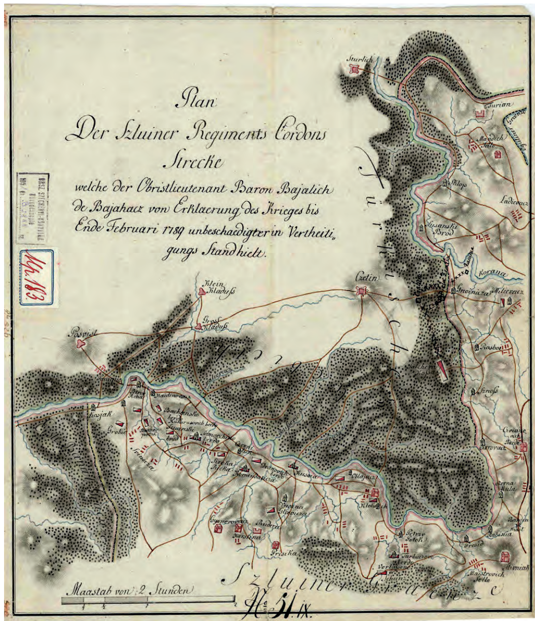
Fig. 10 A map of the eastern part of the Karlovac Generalate (Slunj Regiment) drafted in 1789 during the Habsburg-Ottoman War (1788–1791). Based on the first military survey it was compiled to show the position of local troops. Scale 1:73,000. (National Library Budapest, TK 220)