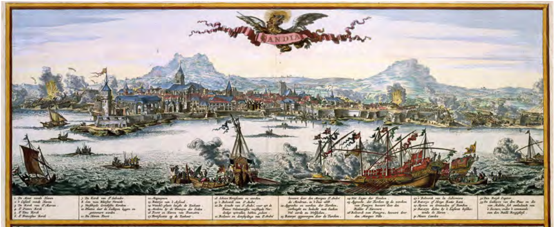
This view of Candia was published by Nicolaes Visscher I (1618–1679). Visscher may have based the print on work by Jan Janssonius (1588–1664).

authorities, calendars, etc.), widely used by the author, shed light on the diplomatic processes among London, Venice and Constantinople during the Cretan War, in the context of the english stormy political scene. In addition, attempting to delve into the ideological background and stereotypes related to the religious scope of the conflict in the Eastern Mediterranean, which directly or indirectly influenced the policies of the parties involved, the author also examines printed sources that resonated with European public opinion, such as newspapers, novels and literary works in general, etc.