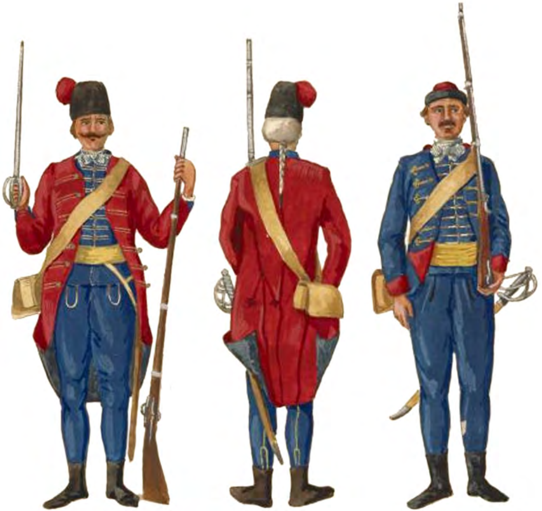
“Oltremarini” (Overseas) Regiments in Venetian service, nicknamed ‘Schiavoni’