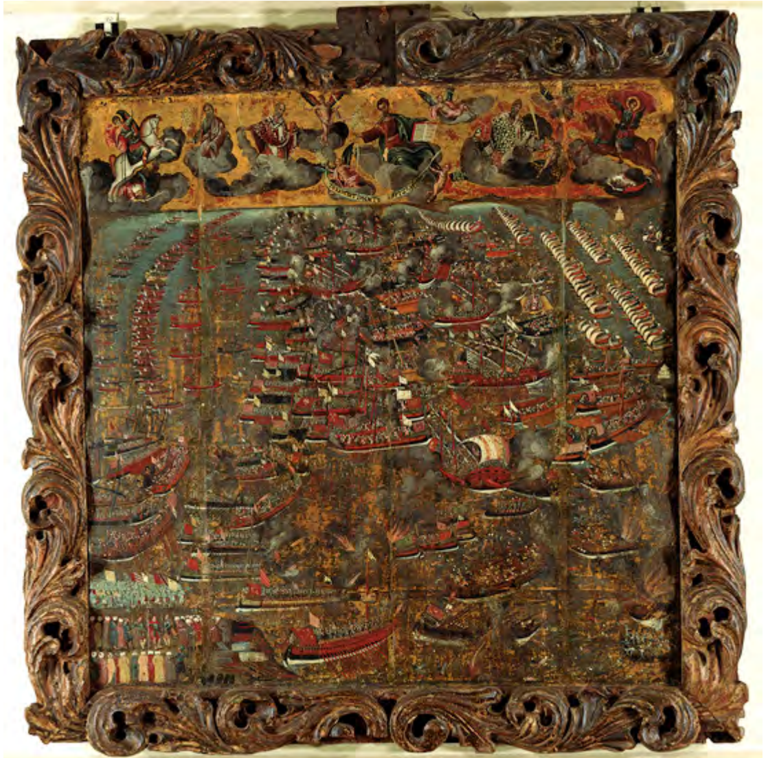
Icon of the naval Battle of Curzolari (Echinades in Greek) islands, by the Cretan painter Georgios Klontzas, last decades of the 16th century; one of the most famous depictions of the naval Battle of Lepanto in post-Byzantine art. Courtesy of the National Historical Museum, Athens (cat. n. 3578).