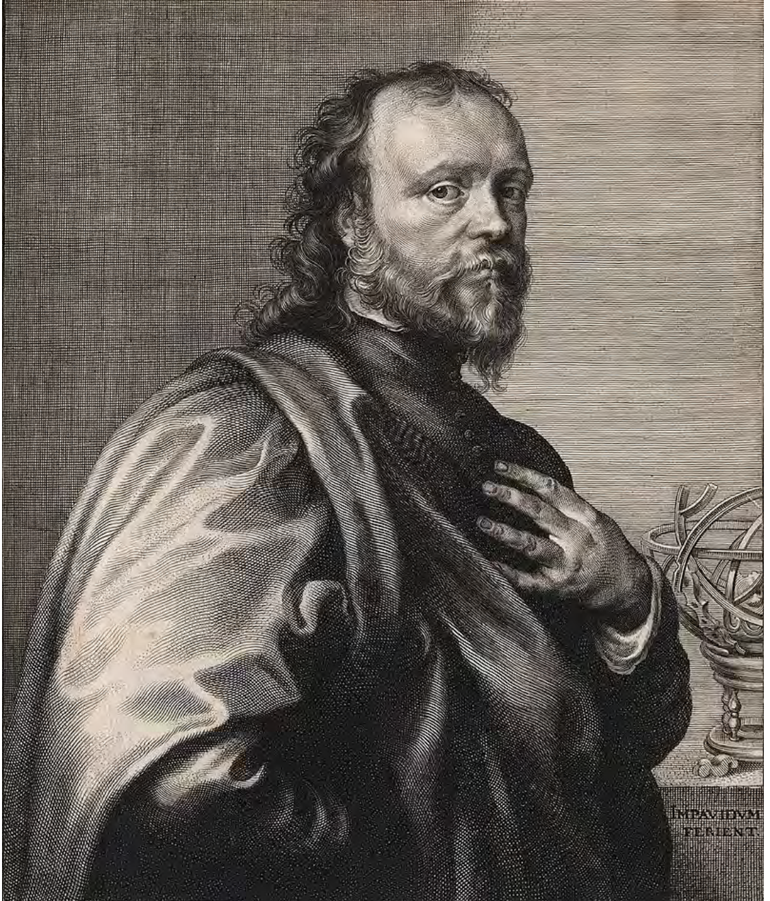
Sir Kenelm Digby (1603–1665), an English diplomat, writer, thinker and privateer (or state-sponsored pirate).