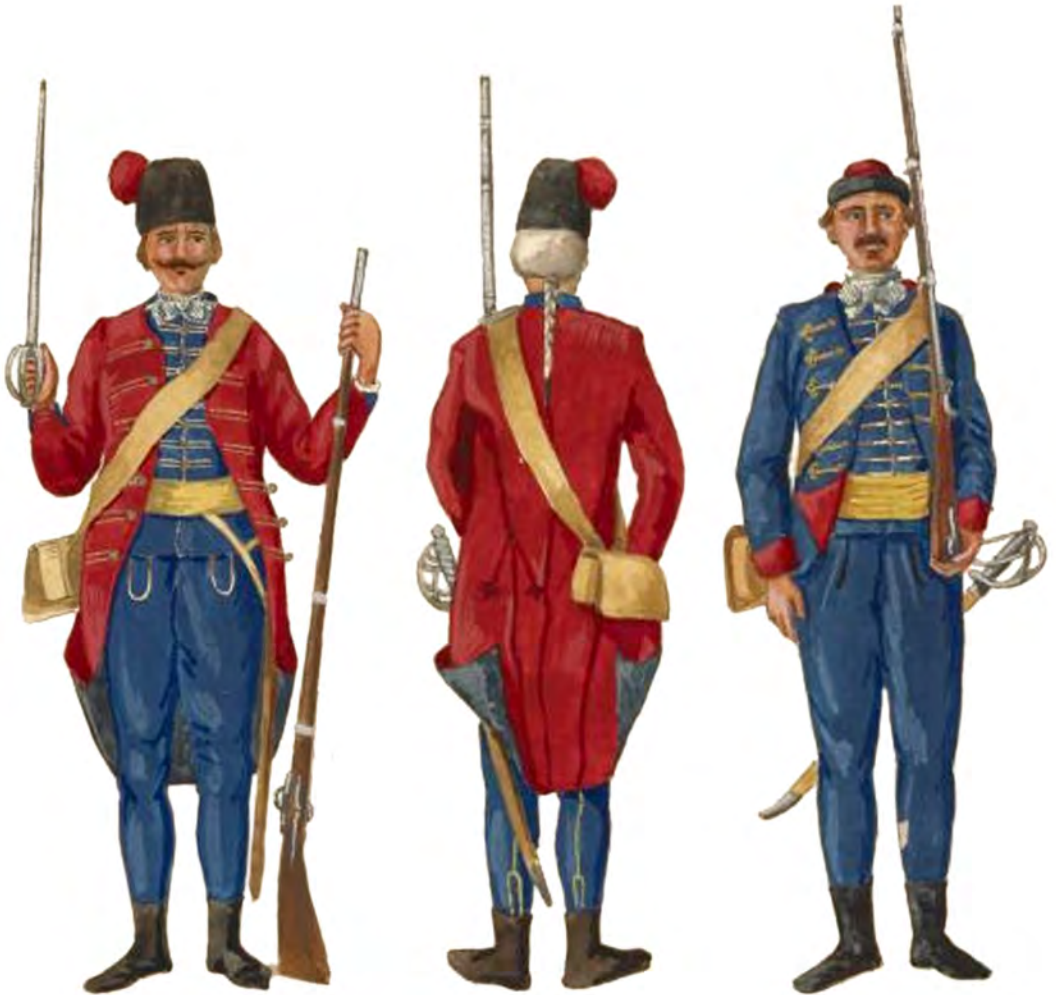
“Oltremarini” (Overseas) Regiments in Venetian service, nicknamed ‘Schiavoni’