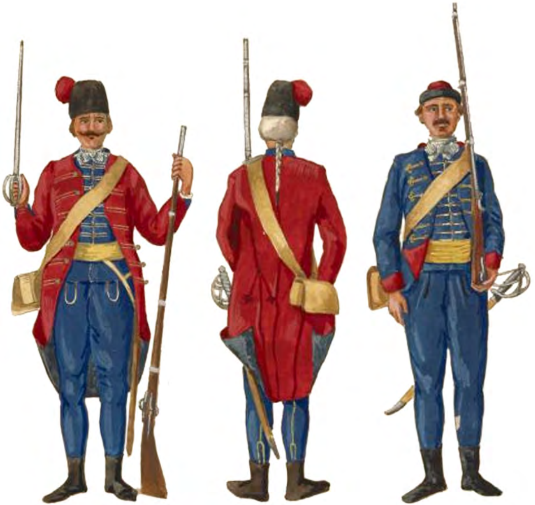
“Oltremarini” (Overseas) Regiments in Venetian service, nicknamed ‘Schiavoni’