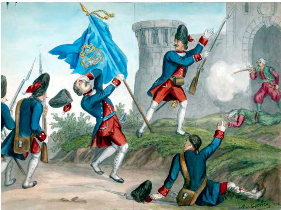
Grenadiers of the Müller Regiment in the service of the Venetian Republic attack an Ottoman fort, 1717.