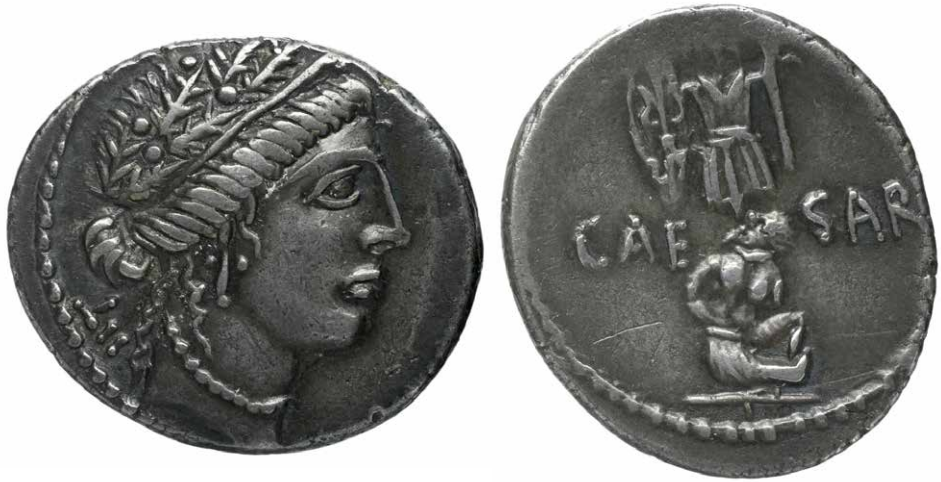
Figure 8: RRC 452/5, minted in 48/47 BCE by Julius Caesar. The obverse has a female head wearing an oak-wreath and a diadem. The reverse shows a trophy holding a Gallic shield and a carnyx. Below rests a bound captive, looking up at the trophy. Image is in the public domain, courtesy of the Bibliothèque Nationale de France, Notice no. FRBNF41987482.