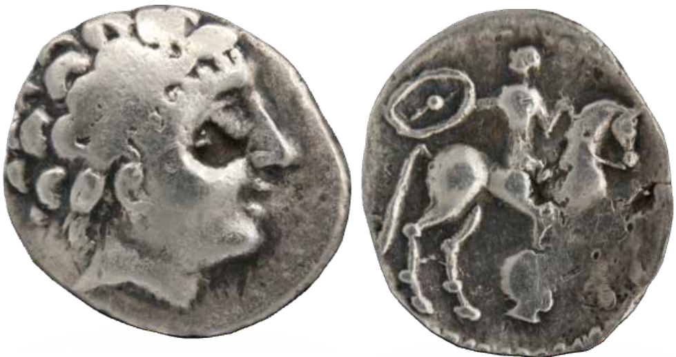
Figure 11: Gallic silver denarius of the Bituriges Cubes, in Central Gaul. The obverse depicts a male head, and the reverse depicts a horseman turning back to the left and holding a shield in his right hand and the reins in his left. Below the horse is a severed head. Image is in the public domain, courtesy of the Ambiani online database, Inventory no. 1887.A.144.