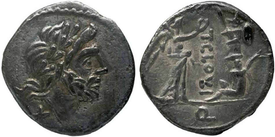
Figure 5: RRC 332/1b, minted in 98 BCE by T. Cloelius. The obverse shows the laureate head of Jupiter. The reverse has Victory crowning a trophy, with a captive, hands bound, at the base of the trophy. A carnyx rests behind the shoulder of the captive, and the trophy wears a horned helmet. Image is in the public domain, from the Bibliothèque Nationale de France, Notice no. FRBNF41980707.

events rather than the achievements of moneymen's ancestors. These Gallic coin references thus spoke to a Roman and Italian audience that had just experienced, if tangentially, the events evinced on the coins.