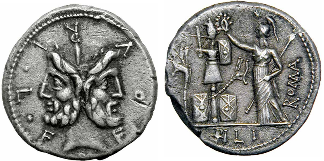
Figure 1: RRC 281/1, minted in 119 BCE by M. Furius Philus.

The coin depicts the laureate head of Janus on the obverse (front), with the inscription M.FOVRI.L.F. (Marcus Furius, son of Lucius). The reverse (back) shows the goddess Roma crowning a trophy. The trophy is surmounted by a boar's head helmet. Two shields and two carnyces (war trumpets) flank the trophy, which also holds a shield and a sword, with the inscription ROMA. Image is in the public domain, courtesy of the American Numismatic Society, Inventory No. 1944.100.561, Coinage of the Roman Republic Online Database.