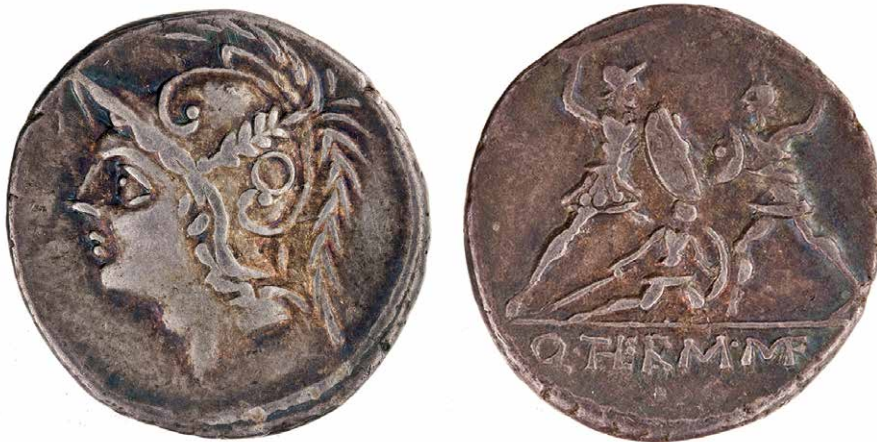
Figure 2: RRC 319/1, minted in 103 BCE by Q. Minucius Thermus.

The obverse shows the helmeted head of Mars. The reverse has a Roman soldier fighting a barbarian while protecting a fallen soldier. The inscription reads Q.THERM.MF (Quintus Thermus, son of Marcus). Image is in the public domain, courtesy of the American Numismatic Society, Inventory No. 1987.26.42, Coinage of the Roman Republic Online Database.