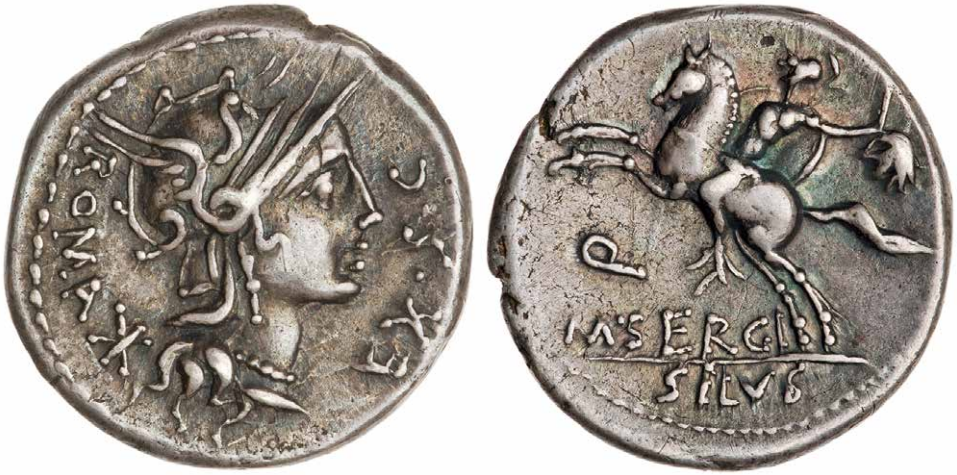
Figure 12: RRC 286/1, minted in 116/115 BCE by M. Sergius Silus.

The obverse has the helmeted head of Roma. reverse image depicts a horseman holding a sword and a severed head in his left hand. Note the hint of longer hair on the severed head, a trait found among Roman depictions of Gallic warriors. Image is in the public domain, Inventory no: 1941.131.92.