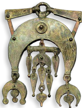
Museo Carnuntinum (Bassa Austria). Pettorale come parte dell'equipaggiamento per cavalli (I secolo) del Reno Settentrionale (?), ritrovamento fluviale.