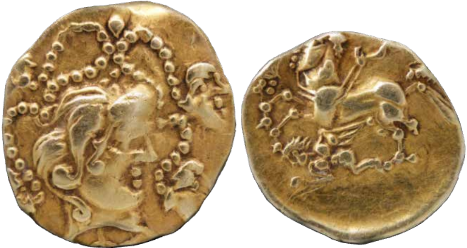
Figure 10: Gallic gold quarter stater of the Veneti (NW Gaul), second century BCE. The obverse depicts a central figure, with beads leading out to severed heads. The reverse depicts a rider on a human-headed horse jumping over a winged figure. The rider holds a stimulus ending in a fringed vexillum, or standard. Image is in the public domain, courtesy of the Ambiani online database, Inventory no. 1887.A.223.