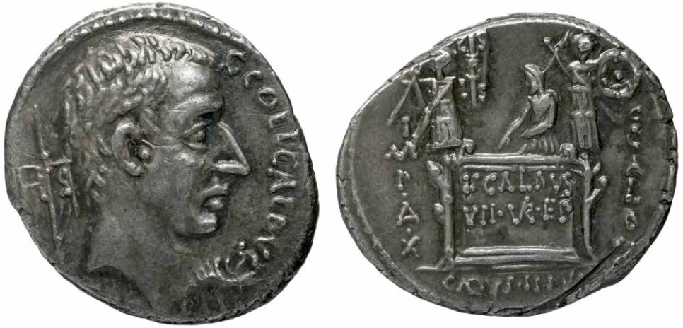
Figure 6: RRC 437/2b, minted in 51 BCE by C. Coelius Calvus. The obverse shows the head of C. Coelius Calvus (cos. 94 BCE), with a military standard in the form of a boar behind. The inscription reads: C.COEL.CALDVS COS HIS (Gaius Coelius Calvus, Consul of Hispania). The reverse has a table with a figure (L. Cloelius Calvus) behind, preparing an epulum (ritual feast). On the left is a trophy with a Macedonian shield. On the right is a trophy with a carnyx and an oval shield. The inscription reads: L.CALDVS/VIIIVIR/EPVL CCALDVIS IMP.A.X (Lucius Calvus, triumvir for the epulum, Gaius Calvus, imperator, augur, decemvir).

Roman visual culture. 45 From carnyces to shields to bearded warriors to trophies, Caesar's coinage evoked every part of the process of conquering, subjugating, and displaying Gallic captives. This is particularly poignant considering that Caesar's campaign is generally credited with the deaths of a million Gallic people, with another million being sold into slavery. The high quality of the coin dies also meant that the images appeared in much better detail than on previous coins, making the references to Caesar's devastation in Gaul highly evocative. Take, for example, RRC 448/2a, minted in 48 BCE (fig. 7). The front of the coin displays the bust of a bearded Gallic warrior with his wild hair fanning out behind him, wearing a torque around his neck. In case the viewer held in any doubt that this man was a Gallic warrior, a Gallic shield sits behind his head. The coin's reverse shows a chariot driver spurring on his horses while his companion faces backward, holding his shield in one hand and throwing his spear with the