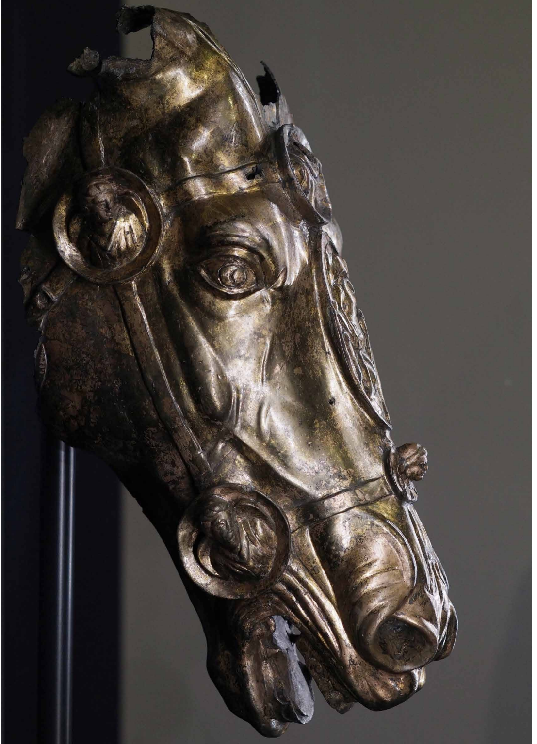
Testa di cavallo di Waldgirmes nel Museo di Saalburg, Bad Homburg.