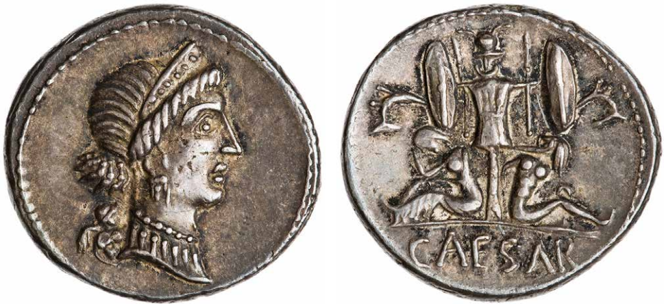
Figure 9: RRC 468/1, minted in 46/45 BCE by Julius Caesar. The obverse shows the head of Venus wearing a diadem. The reverse has a trophy, holding an oval shield and a carnyx in each hand. Seated on the bottom left is a female figure with her hand in her hand as a sign of mourning. On the bottom right is a bearded male captive, hands bound, looking up at the trophy.